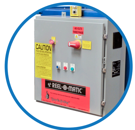
UL CERTIFIED PANEL BOX