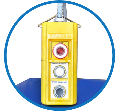
FAST/SLOW REMOTE PENDANT CONTROL